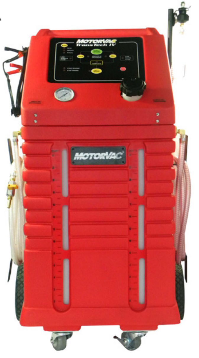
Part No. 500-1125

Dipstick Exchange - TransTech IV features a convenient Dipstick option that allows an effective ATF exchange through the transmission dipstick tube. This useful alternative is suitable when cooler lines are corroded or difficult to access.