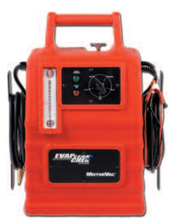
Part No. 500-0333