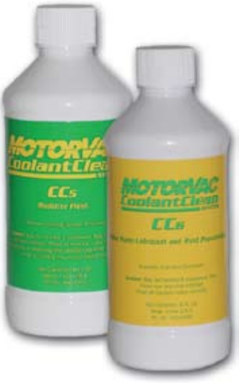
MotorVac CC5 & CC6

Case of 6 (2 Step Service Kits) Part # 400-0138