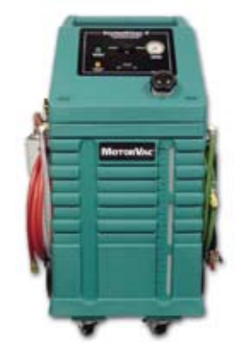
The CoolantClean service kit is specifically formulated to be used with the CoolantClean system!